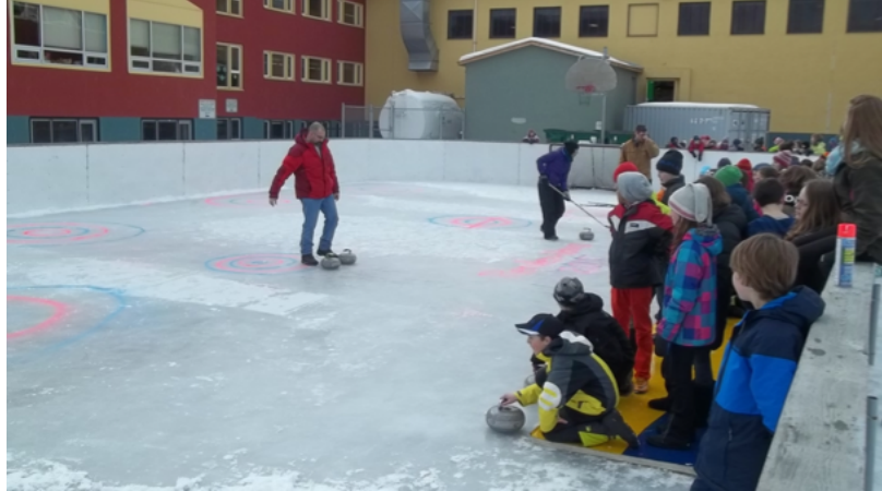
Rendez-vous festives chez nous!